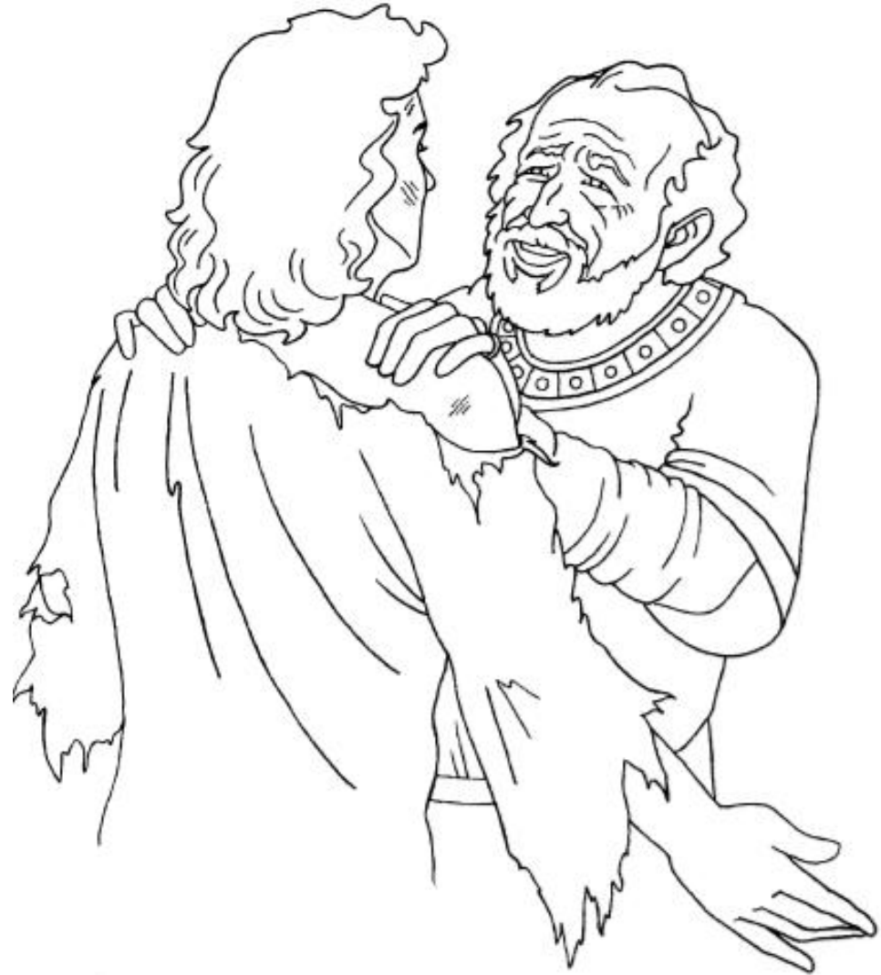
"Jesus told the parable of the prodigal son." Luke 15:11-32