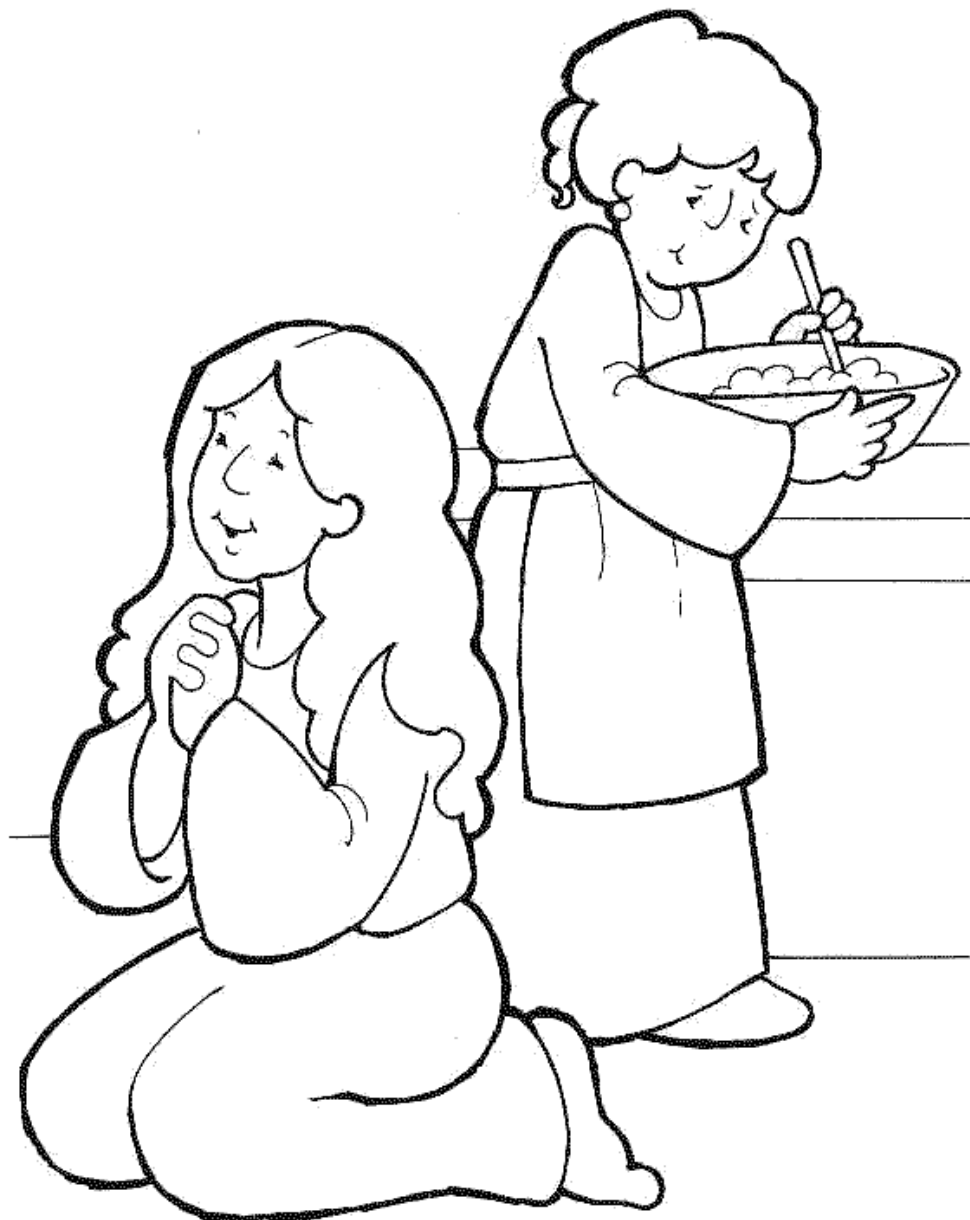
Mary talked with Jesus while Martha cooked.